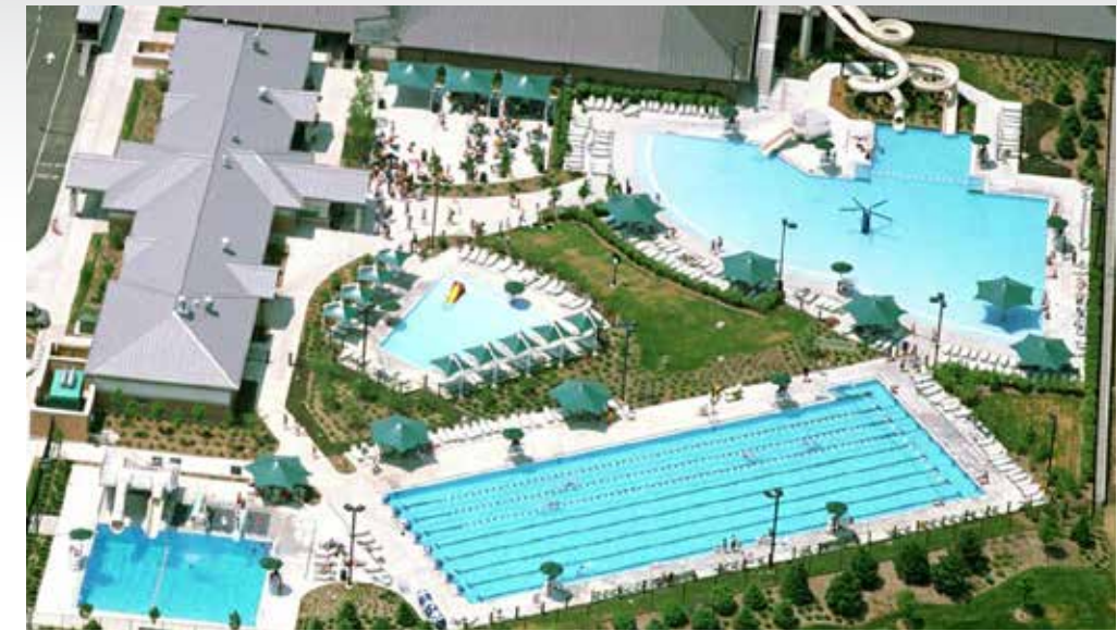
Wilmette Park District | Wilmette, IL