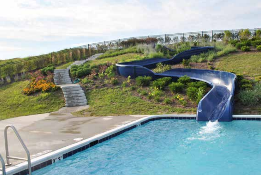
Chicago Highlands Country Club | Westchester, IL