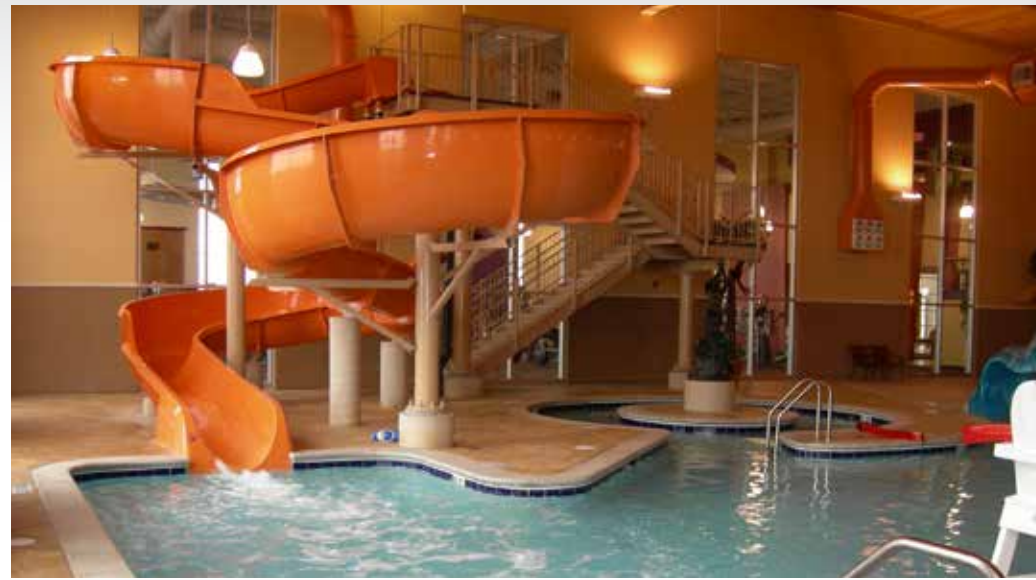
Peak Fitness | Loves Park, IL