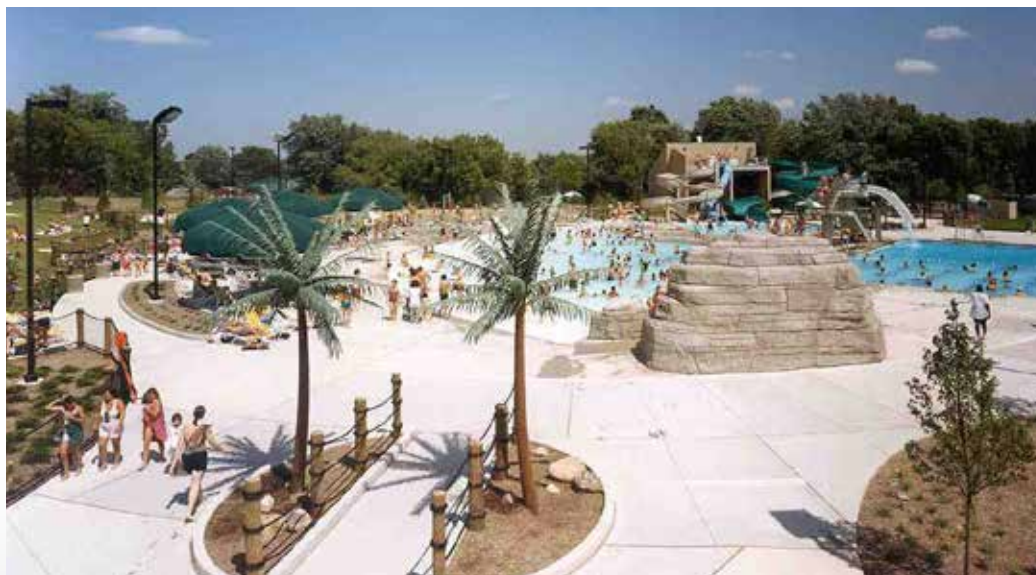
Hanover Park District | Hanover, IL