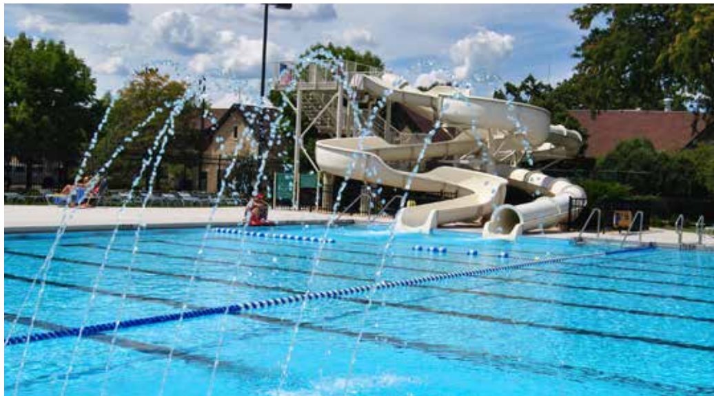
Pottawatomie Park | St. Charles, IL