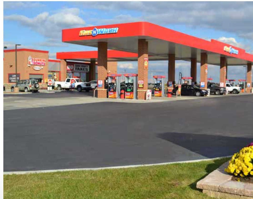
Gas & Wash | Mokena, IL