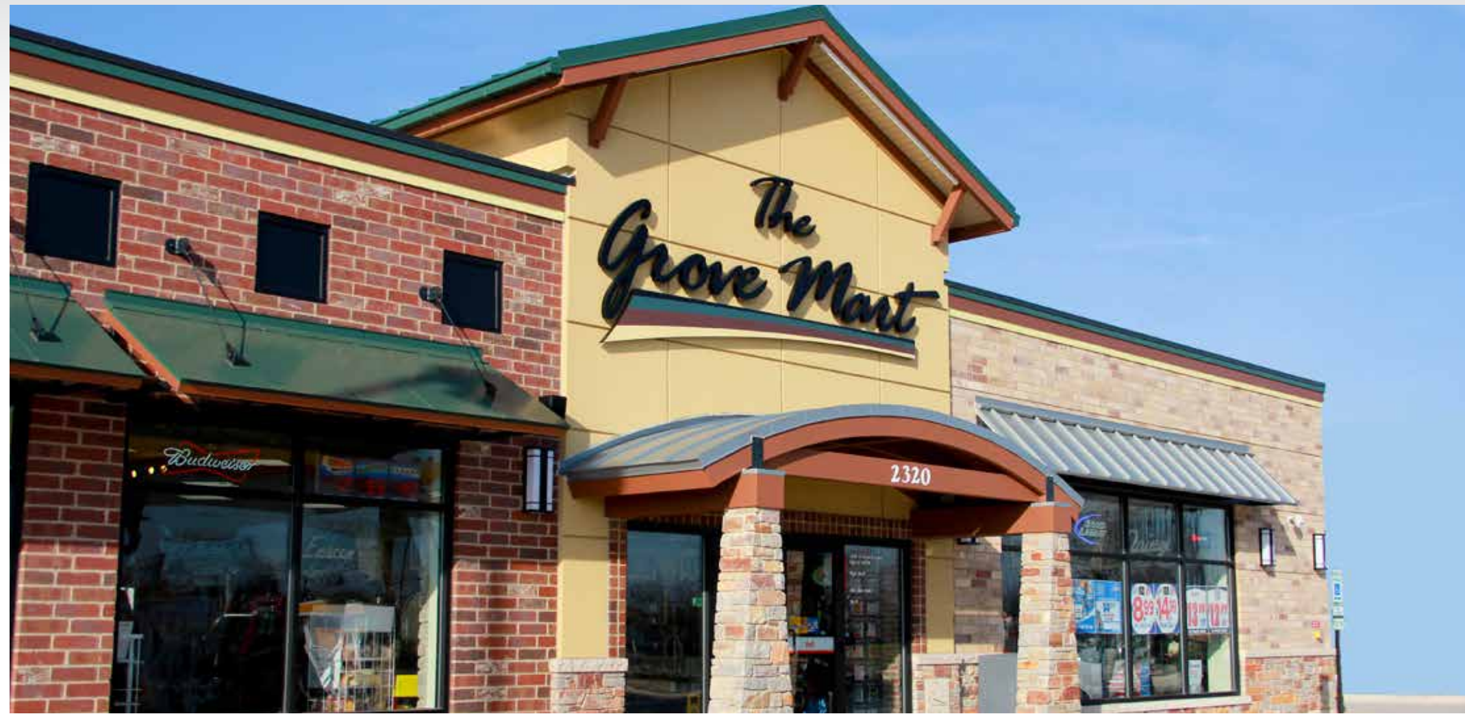
The Grove Mart and Shell | Elgin, IL

Pratum Construction Services, LLC functions as an independent enterprise within the W-T Engineering, Inc. Family of Companies. Clients can hire the Family as subcontractors or as a project lead when appropriate. This partnership provides us with stability and support when a project requires outside expertise, yet allows us to operate with flexibility and void of obligation.