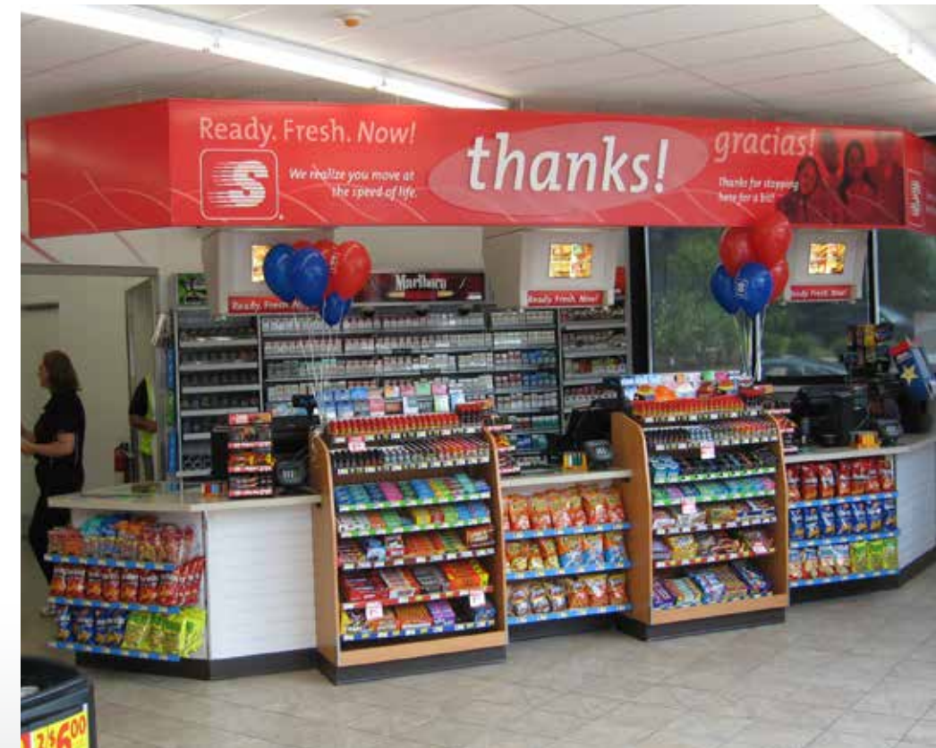
Speedway | Lockport, IL